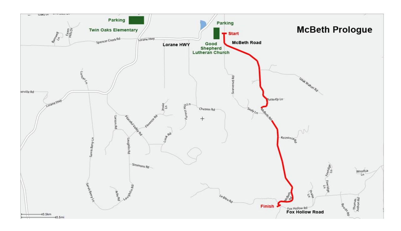
85780 McBeth Road, Eugene OR 97405

Pro 1/2 $700 - 10 deep Women 1/2/3 $400 - 5 deep Cat 3 $300 - 5 deep Cat 4/5 $200 (Gift C) - 5 deep Masters 40+/50+/60+ $300 2 deep each Cat 4 Women $100 (Gift C) 5 deep