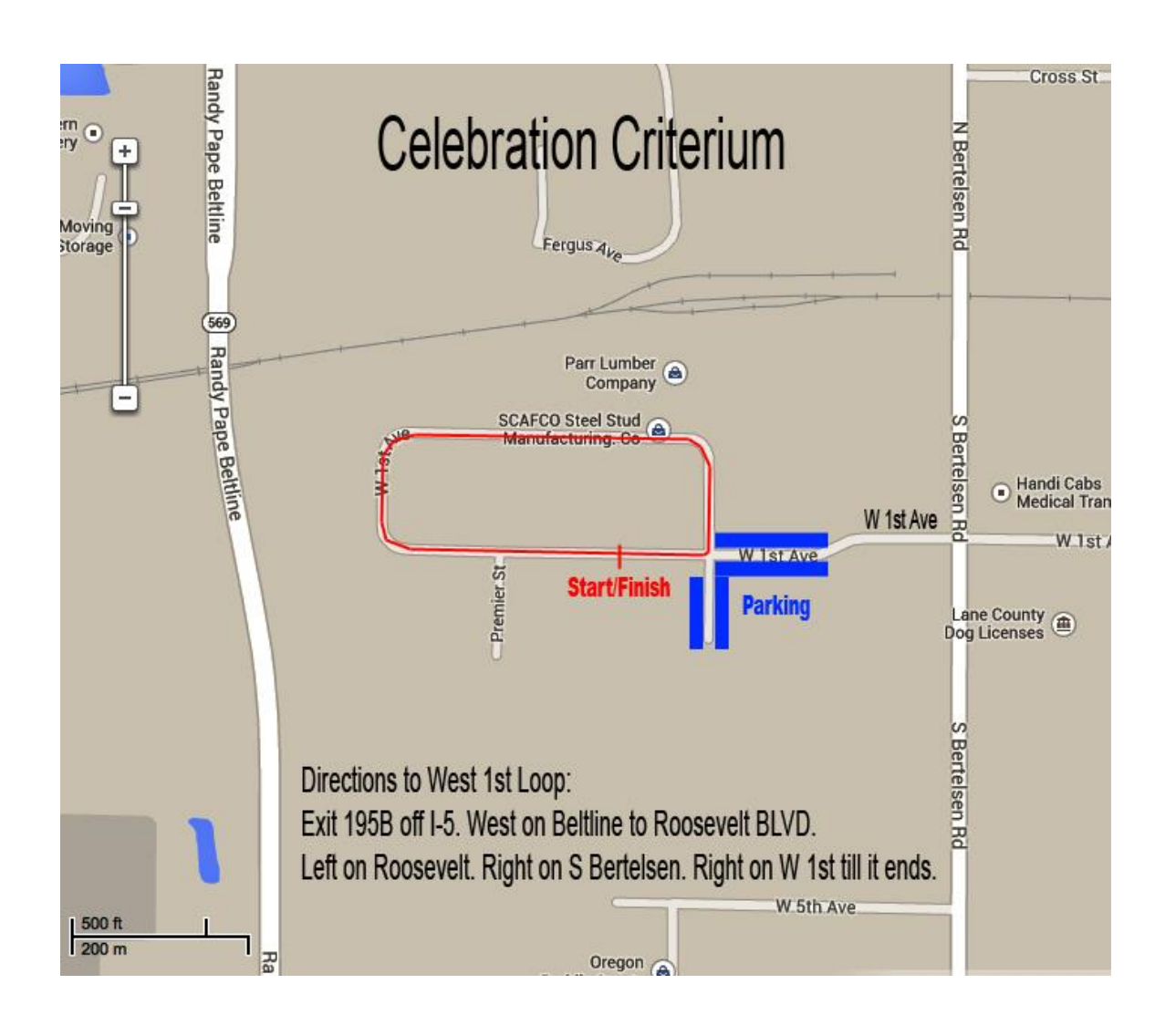
4051 W 1st Ave, Eugene OR 97402